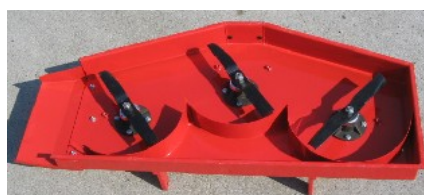
Nr.3 blades diam.400 thickness 6,5 high ventilation – tangential speed 94 m/s